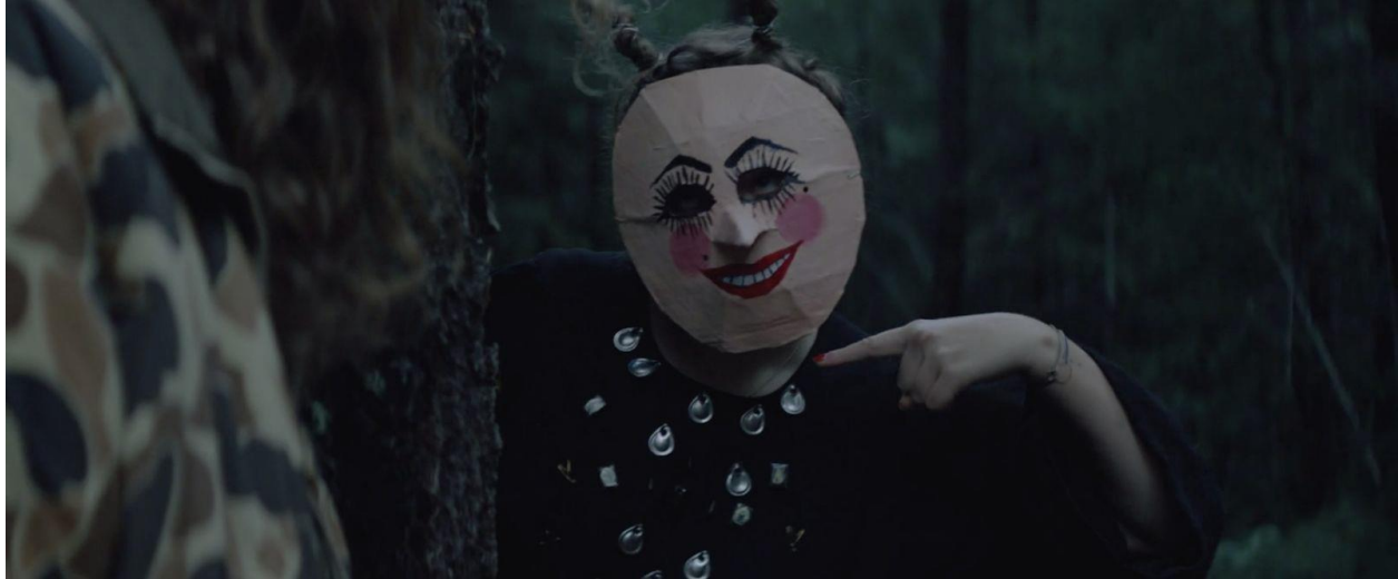
From “Your Favorite Color”