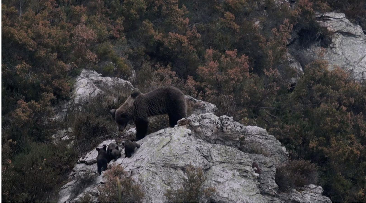
From "Oso, Wild Vision from Asturias"