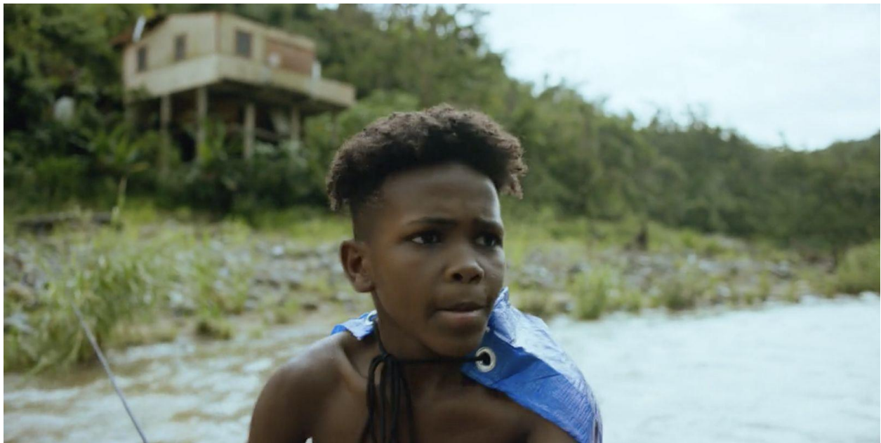
From “La Capa Azul”

A young boy faces the challenge of saving his sickly grandfather during the devastation of Hurricane Maria.