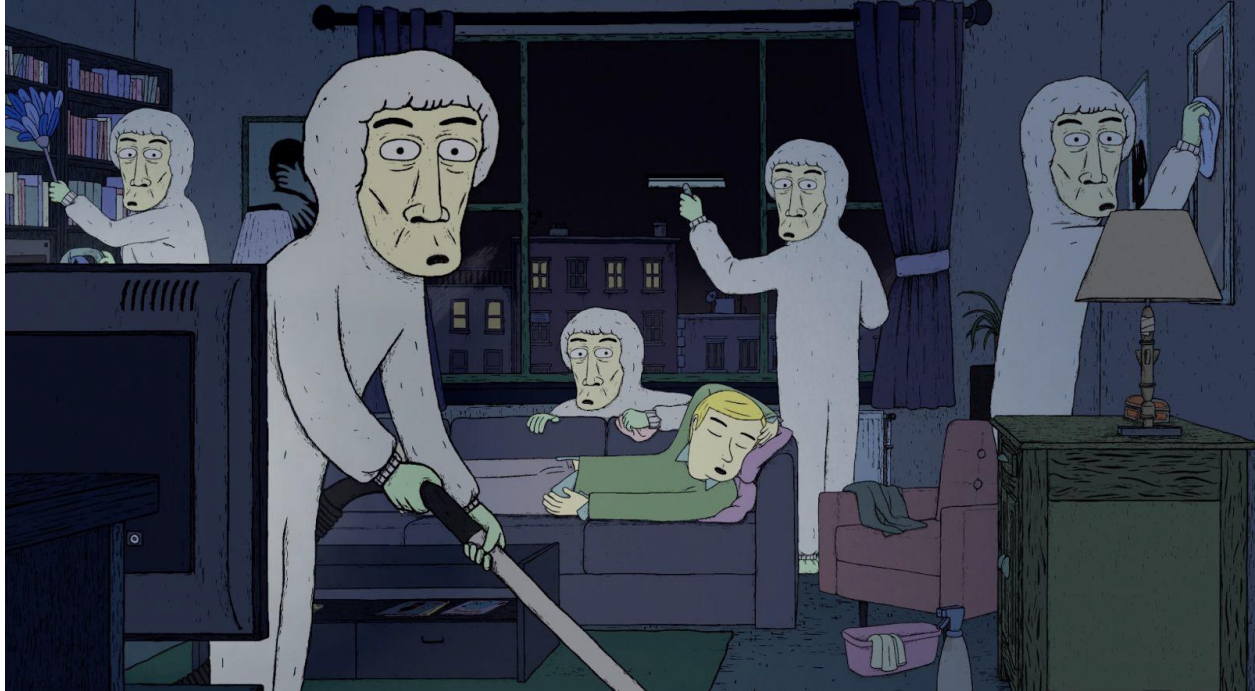
From “I’m going out for cigarettes”