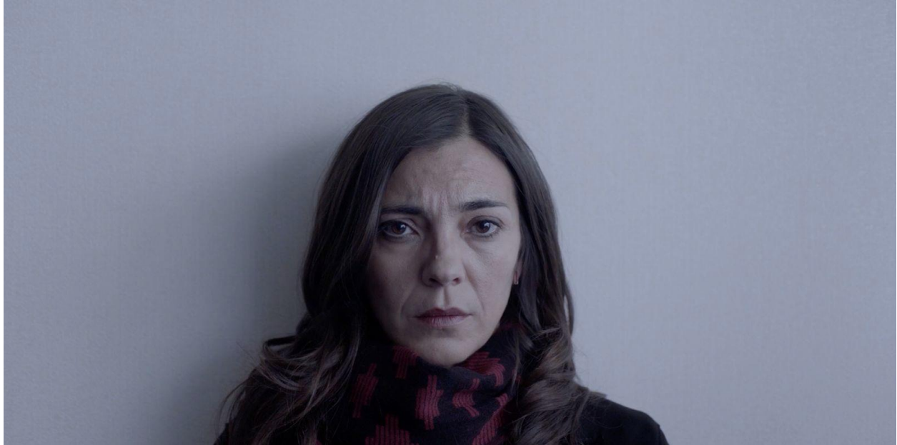
From "Bright Side in D Minor"