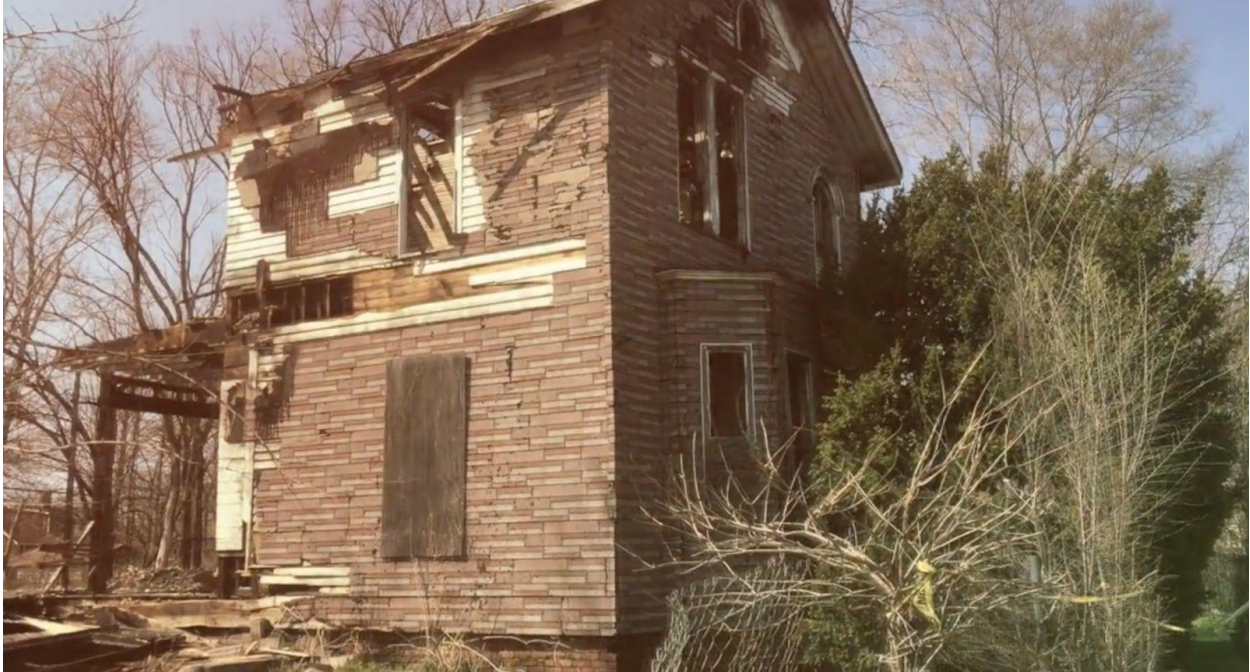
From "Uncle Frank's House: An American Dream"