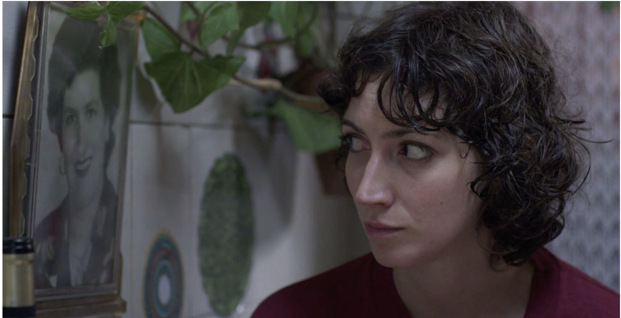
From “BORA BORA”

Seeking to escape her past life, Julia moves into a new building, where everything and everyone seems to plot against her. An elderly neighbour, Rosita, presents her with a reality she is trying to avoid: motherhood, marriage or a lack thereof. But can an alliance between the two women save Julia from this limbo, or is it already too late?