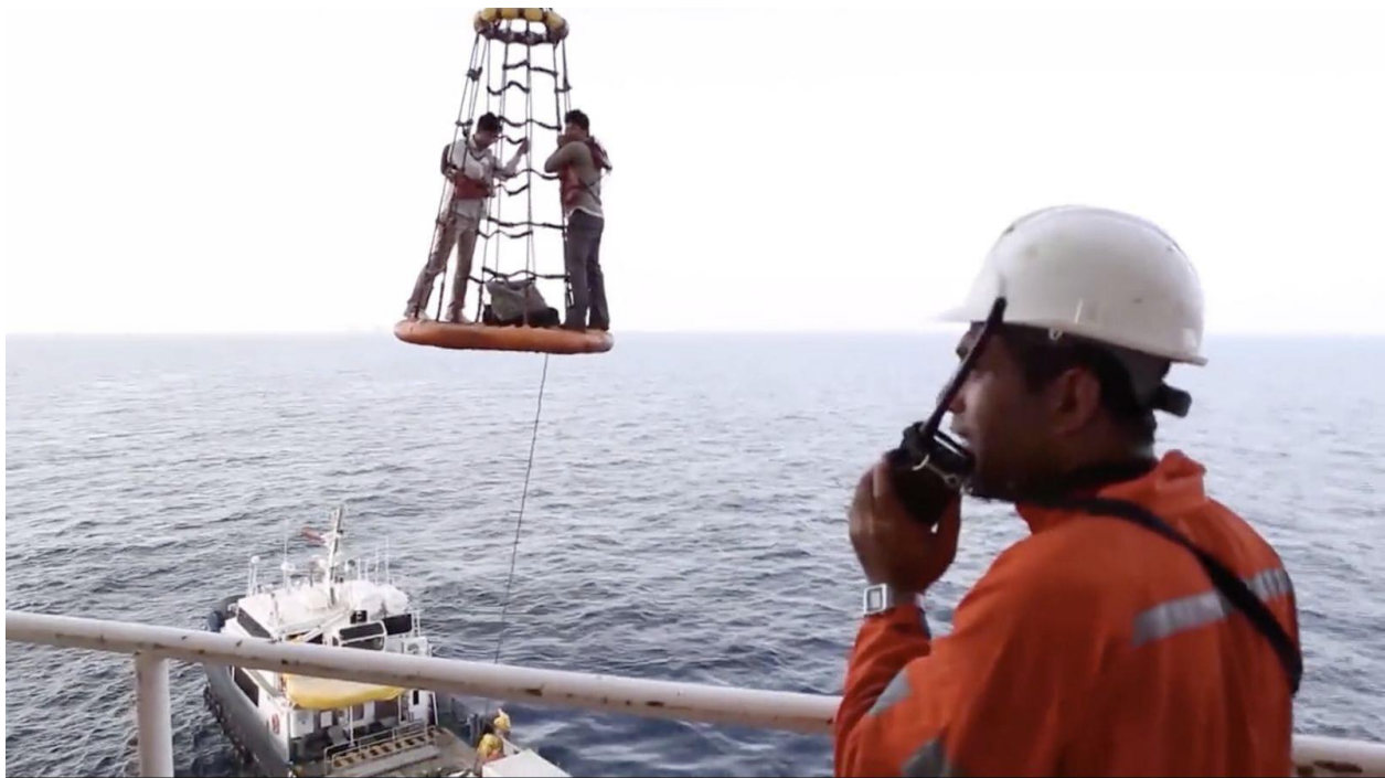
From “14 + 2”

A worker the Gulf gas platforms plans to hold his wedding ceremony in two weeks. However, the difficult conditions of the sea climate challenge the plans.