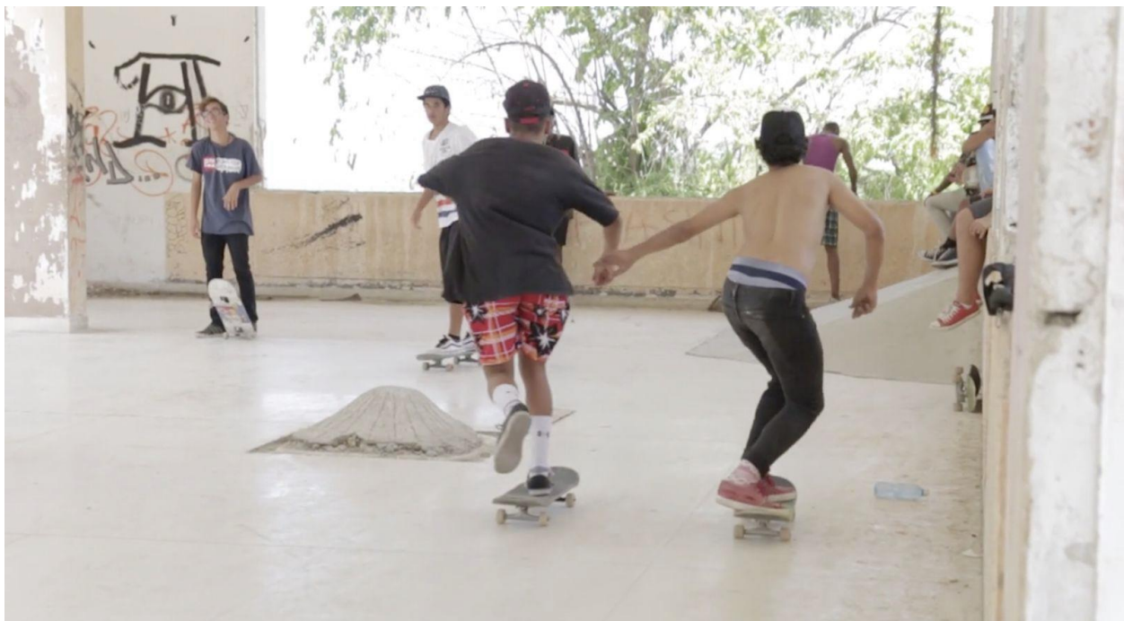
From “Skating Cuba”

Short documentary showcasing the first mini ramp build in Havana, Cuba.